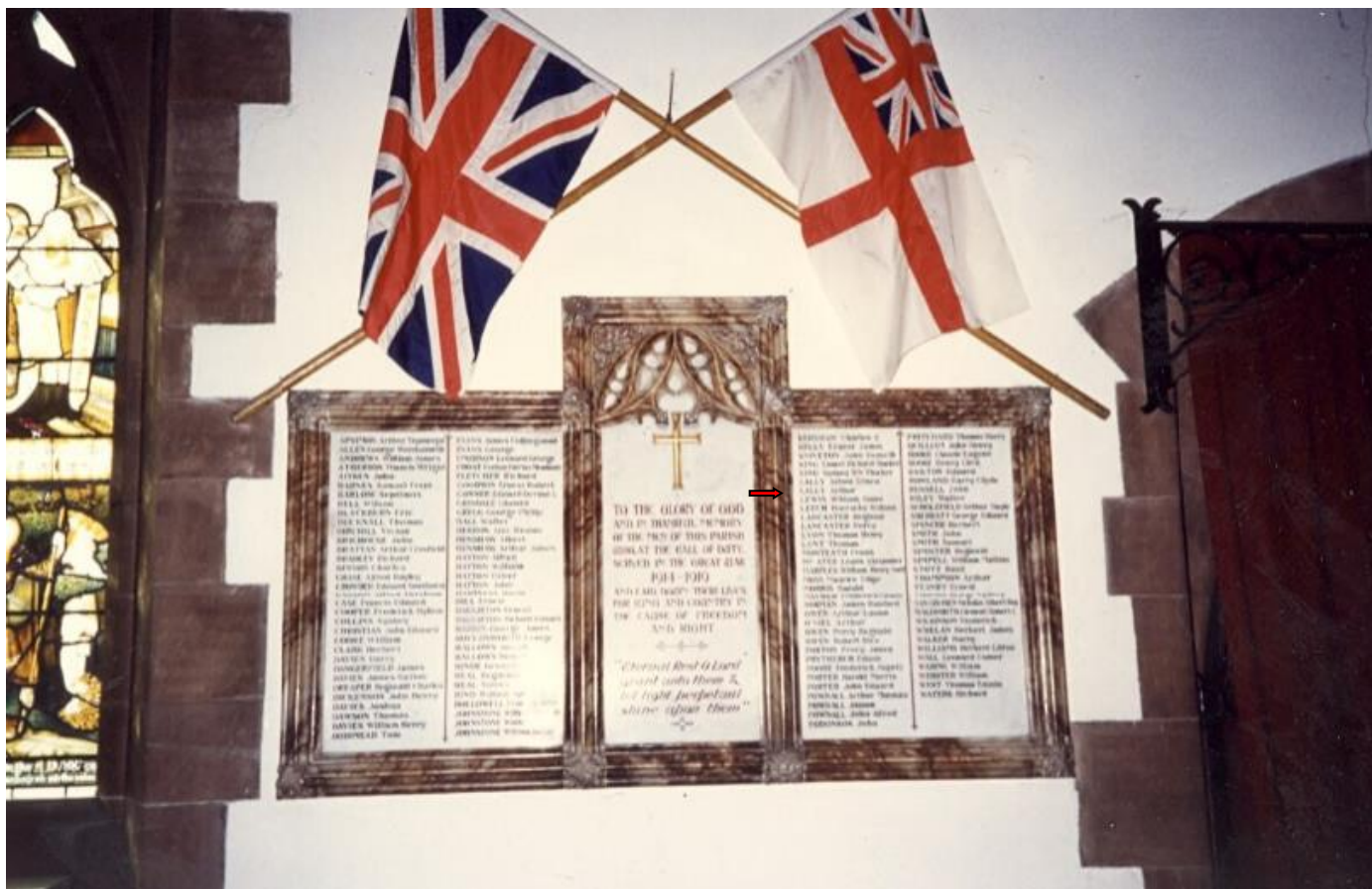
Great War Memorial Tablet – West Kirby