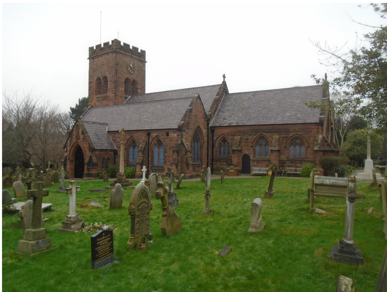
St. Bridget's Church, West Kirby

St. Bridget's Churchyard, West Kirby contains 11 Commonwealth War Graves – 9 relating to World War 1 & 2 from World War 2.